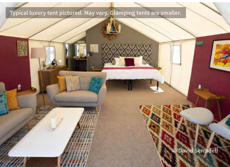
Typical luxury tent pictured. May vary. Glamping tents are smaller.